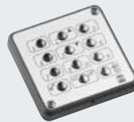
CTV 1 / CTV 3 code switch For 1 or 3 functions, especially robust, protected against vandalism.