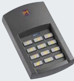
FCT 3 BS radio code switch // NEW For 3 functions with illuminated buttons