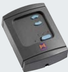
FIT 2 radio internal push button For 2 operators or operator functions