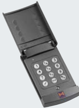
CTR 1d / CTR 3d code switch For 1 or 3 functions with hinged protective cover.