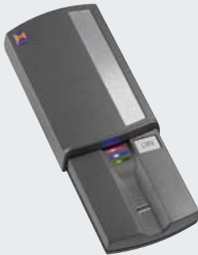
FFL 12 BS radio finger-scan // NEW For 2 functions and up to 12 finger prints