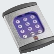
CTR 1b / CTR 3b code switch For 1 or 3 functions, with illuminated buttons and weather-resistant membrane keypad.