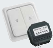
Recessed radio transmitter For two functions, in conjunction with a commercially available recessed switch. For central installation in a hallway / living room within sight of the garage door.

HSU 2: for all commercially available switch boxes with 55 mm Ø connection to the house mains supply