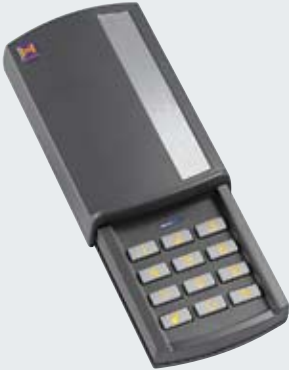
FCT 10 BS radio code switch // NEW For 10 functions with illuminated buttons and protective cover